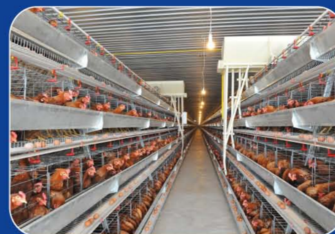
Galvalize Feed Trough 2.15 M